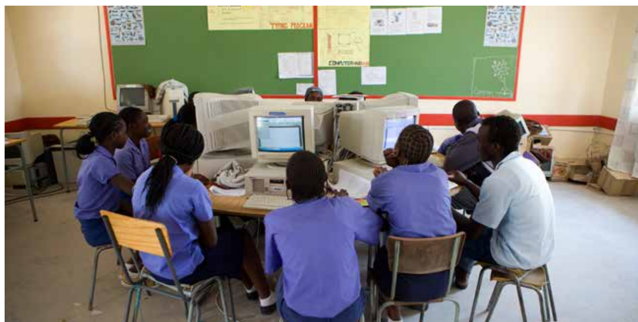
> Electricity use in classroom to support use of information technology in Namibia.

objective globally will depend critically on the progress that can be made in these countries. A third group of 20 high-income and emerging economies accounts for four-fifths of global energy consumption. Thus, the achievement of the global SE4ALL objectives for renewable energy and energy efficiency will not be possible without major progress in these high-impact countries.