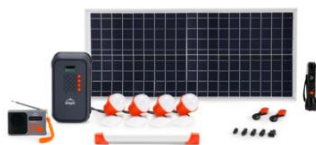
X2000 Solar System