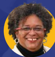
H.E. MIA MOTTLEY

CEO and Special Representative of the UN Secretary-General for Sustainable Energy for All, Co-Chair of UN-Energy