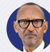
H.E. PAUL KAGAME

Second Lady of Ghana, CEO of Samira Empowerment and Humanitarian Projects (SEHP)