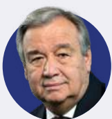
H.E. ANTÓNIO GUTERRES